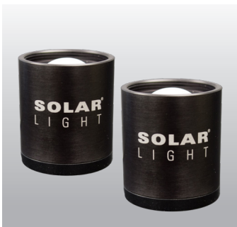
Included NIST-Traceable SUV & UVA Sensors