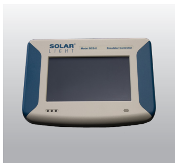
Included DCS-2 Automatic Dose Controller